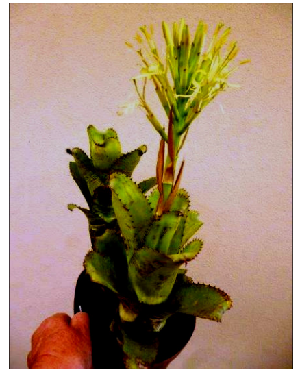
Billbergia horrida . Below, Tillandsia bulbosa hybrid.

It grows with my other Billbergia in a sunny spot and I don't water them often.