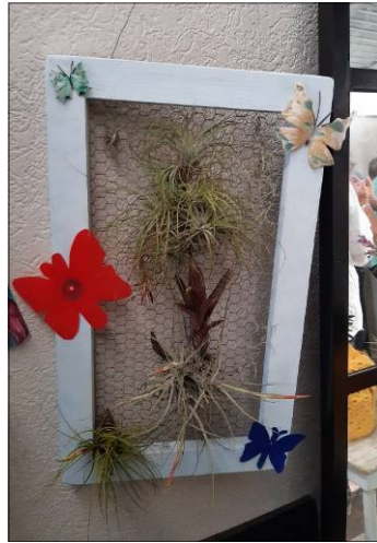
One of Lyn Odendaal's