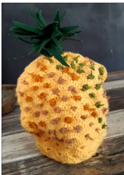
Gail Allner's pineapple tea cozy !