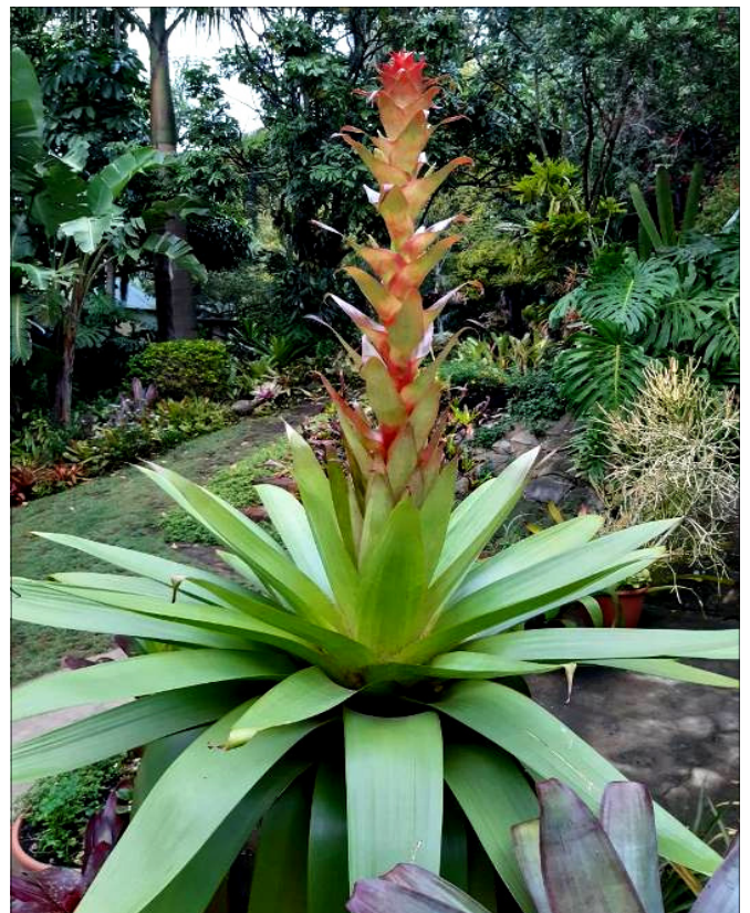
Look at me now!!!!!!!!!!!!!! My Alcantarea imperialis is growing by the day. A month ago the crown of the flower spike was just peeping over the leaves, now the paddles are emerging.