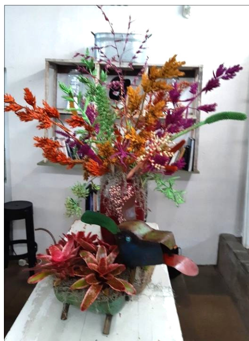
Brenda Wegner's fabulous displays.