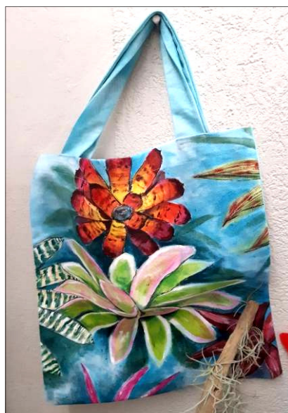
Xenia Winther's painted fabric bag, commissioned by Lyn Wegner.