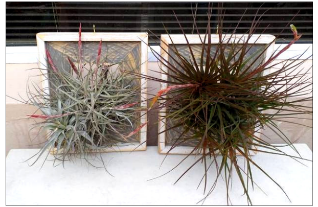
Lorraine Parathyras's mounted tillies.