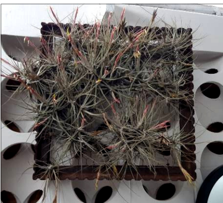
Left: Danie Conradie brought along a frame he made out of metal fencing poles and mounted with Tillandsia schiedeana .