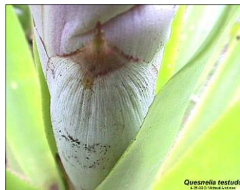
A true Q. testudo will have spines on the bracts like the ones in the photo.

I was not sure if mine was Q. quesneliana or Q. testudo as the inflorescences are very similar, shocking pink with tiny blue flowers. There appears to be a red form of Q. quesneliana . I looked it up and apparently each has very different scape bracts. Q. testudo has bracts that develop tightly around the stem and are serrated. Q. quesneliana has crinkly, papery, spineless bracts as you can see in my photo. If anyone can shed more light on this, do e-mail me.